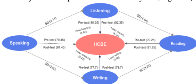
Fig. 2 Normality test (Compiled by the authors)

This study conducted a normality test to examine the distribution of data collected from the participants. The normality test, with a probability value of 0.194, indicated that the result exceeded the conventional significance level of 0.05. Consequently, the data were determined to follow a normal distribution, meeting the normality assumption. This finding ensures the reliability of subsequent statistical analyses (Figure 2).